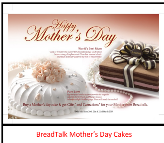
BreadTalk Mother's Day Cakes

many mother's feeling rewarded and appreciated.