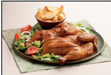
Really, really, really, really, really, really good chicken...and peri-good for you

So it's great tasting AND nutritionally hot? Yes because the truth is that the very same Peri-Peri that amps up our chicken is loaded with antioxidants that